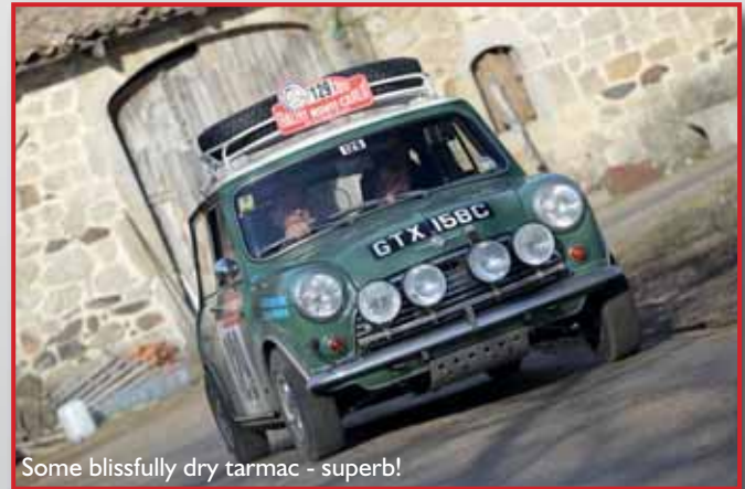
Some blissfully dry tarmac - superb!