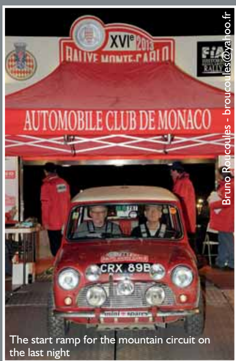
The start ramp for the mountain circuit on the last night