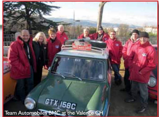
Team Automobiles BMC at the Valence CH