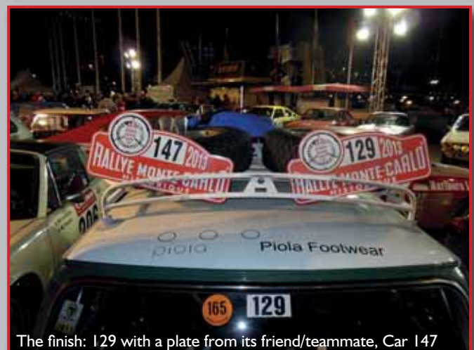
The finish: 129 with a plate from its friend/teammate, Car 147