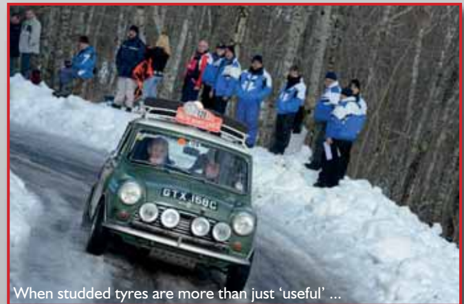
When studded tyres are more than just 'useful' ...