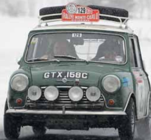
Typical driving conditions in the Vercors Region